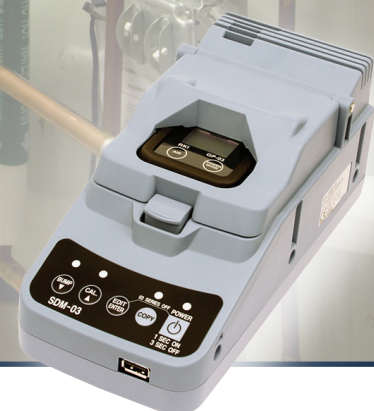
Calibration Station SDM-03