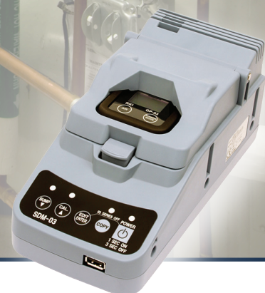
Calibration Station SDM-03